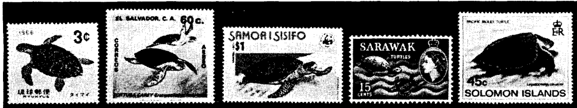
Ryukyu Is. 137 El Salvador SG-1665 Western Samoa 471 Sarawak 204 Solomon Is. New