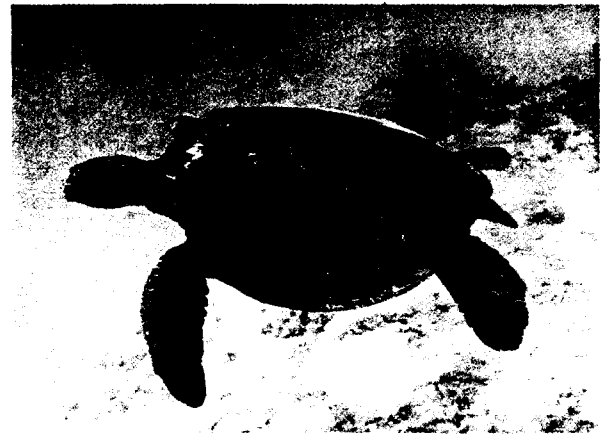
Adult female Hawaiian green turtle.

Two persons recalled from memory the catching of turtles on Polihua Beach during the 1920's. The sharp decline in nesting during subsequent years has been attributed to the construction of roads, increases in traffic to the north shore, and easier access for taking turtles on the beach. A dirt road now leads directly to Polihua. Other possible adverse factors to nesting, which have also been speculated upon, include changes in coastal vegetation and heavy erosion at higher elevations (Balazs 1975).