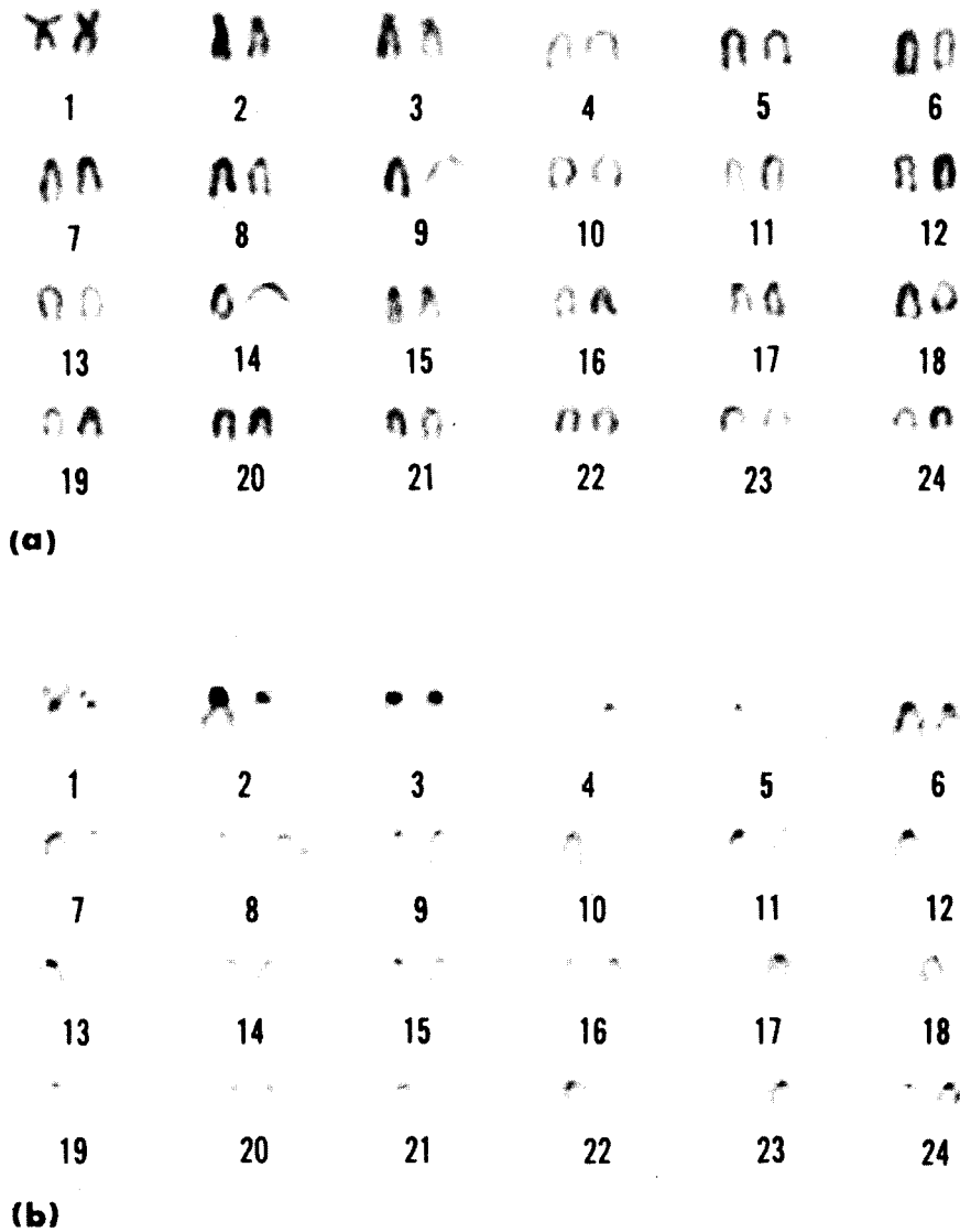
FIGURE 2.—Giemsa stained karyotype (a) and C-banding karyotype (b) from two different fish of the North Pacific albacore.

tuna. Gibbs and Collette (1967) proposed that seven species of tuna be included in the genus Thunnus on the basis of external morphological and internal anatomical characters. Our results demonstrate that there is a genetic basis for placing the albacore, T. alalunga , and the yellowfin tuna, T. albacares , in one genus Thunnus and the skipjack tuna, Katsuwonus pelamis , in a separate genus. These relationships are based on the assumption that