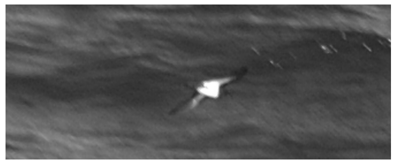
Figure 1. Fregetta storm-petrel, presumed White-bellied Storm-Petrel ( F. grallaria ), 456 km SE of Isla Clarion, Mexico (14° 50.52′ N, 112° 35.46′ W), 29 November 2006. Note the apparently entirely white belly and white underwing coverts contrasting with the blackish breast and head.

The bird was a small storm-petrel, appearing slightly larger in size than a Wilson's Storm-Petrel ( Oceanites oceanicus ), although no other birds were nearby at the time for comparison. It propelled itself with its feet, leaving small "rooster-tailed" splashes on the water (Figure 2), a characteristic of Fregetta and closely related genera of storm-petrels. The storm-petrel appeared to have a dark throat, a square or rounded tail, clear white underparts, white underwing coverts, and white uppertail coverts.