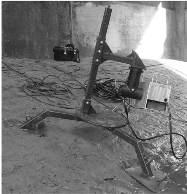
Figure 1. DIDSON mount design used for our trial on the San Lorenzo River, California in March 2006.

Some care had to be taken in situating the DIDSON unit so as to maximize acquisition of useful data. The DIDSON was deployed in the water near one bank and aimed toward the opposite bank to enable determination of directionality of fish passage. The sound beam produced by the DIDSON unit widens with distance from the unit, in both the vertical and horizontal planes, producing a wedge-shaped zone of ensonification. Ideally, a cross-section of channel should be completely ensonified so that no migrating fish can pass undetected. Consequently, we chose a section of channel whose profile resembled a wedge shape, and that started shallow on the near-bank and gradually deepened to allow for the greatest beam spread across the entire channel width. The channel was 20 m wide, with a depth ranging from about 0.5 m at the DIDSON side of the channel to 1.5 m at the opposite side (Figure 2).