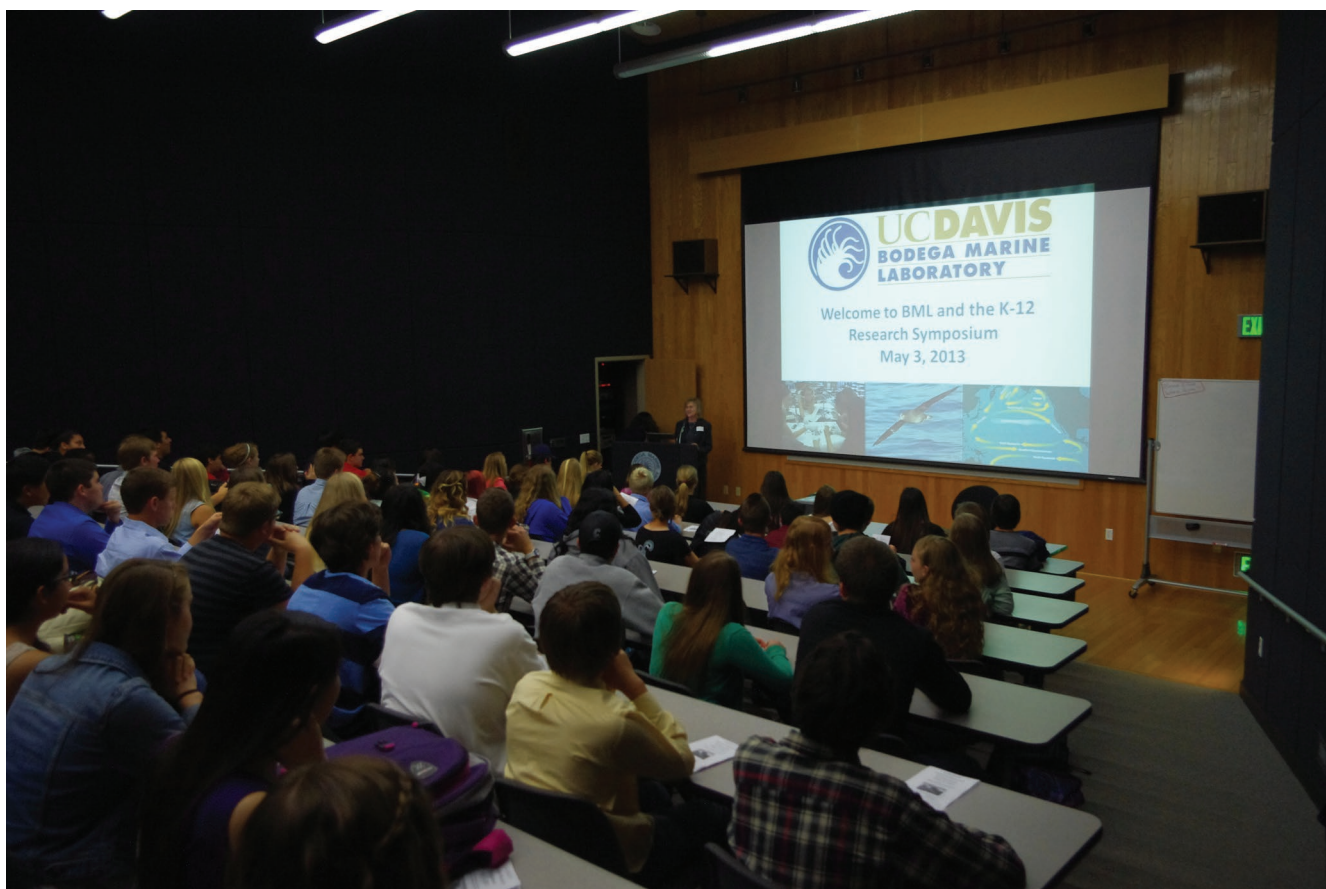
Figure 2. High school students present their research projects during the CAMEOS symposium at the University of California, Davis, Bodega Marine Laboratory. The students gain science communication skills, peer feedback, and reflect on the broader implications of their projects. The most valuable outcome is the boost in student self-confidence.

contrast to what new exploration or question they would tackle next. Retrospection has its place but can stifle prospective thinking and further inquiry, crucial components of scientific advancement. Scientists can challenge students to transfer knowledge gained from one project to a new scientific endeavor—for example, CAMEOS scientists asked students to design a follow-up experiment or mentor new students through a new task reliant on skills they had attained.