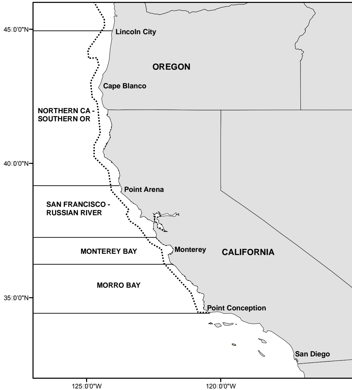
Figure 1. Aerial survey study area, showing harbor porpoise stock names and boundaries, transect lines, (bold), and approximate range of harbor porpoise from shore to 200 m in this region (dashed).